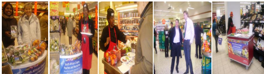
In store tastings at Asda, Morrison's and Sainsbury

Once again a huge thank you to the following exporters/export agents for their contribution: United Exports, North End Vineyards, De Pont Boedery